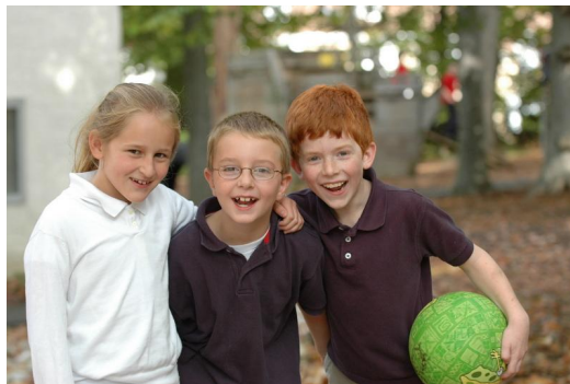
Future Benchmark Alums